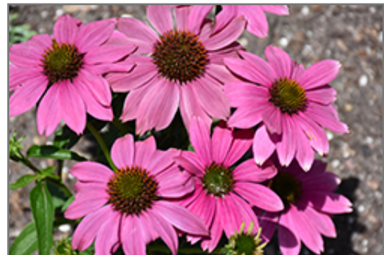
PowWow Wild Berry Coneflower flowers