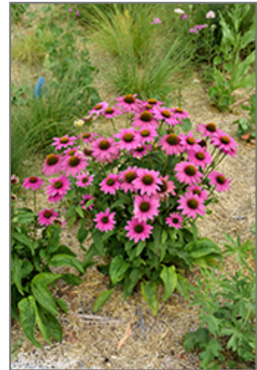
PowWow Wild Berry Coneflower in bloom

This is a relatively low maintenance plant, and is best cleaned up in early spring before it resumes active growth for the season. It is a good choice for attracting birds and butterflies to your yard, but is not particularly attractive to deer who tend to leave it alone in favor of tastier treats. It has no significant negative characteristics.