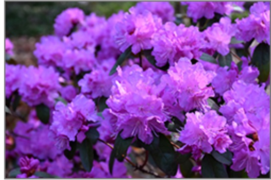
P.J.M. Elite Rhododendron flowers

P.J.M. Elite Rhododendron is recommended for the following landscape applications;