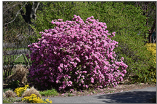
P.J.M. Elite Rhododendron in bloom