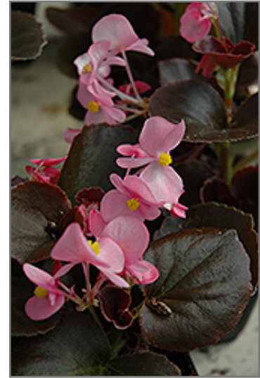
Cocktail Gin Begonia flowers