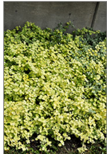
Lemon Licorice Plant