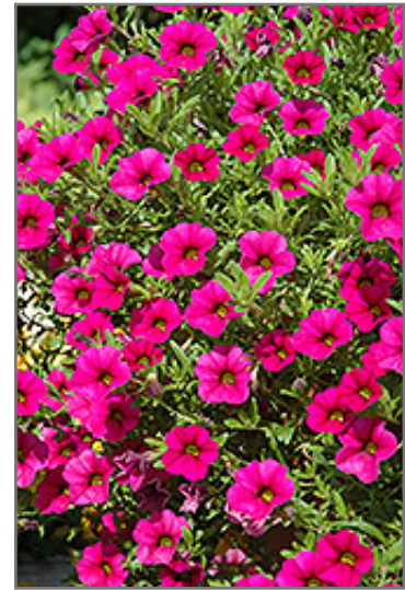
Cabaret Rose Calibrachoa flowers