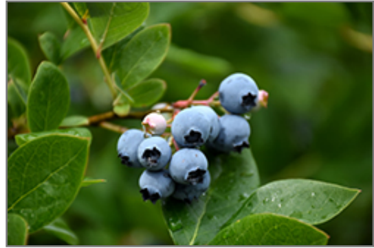
Northcountry Blueberry fruit

Northcountry Blueberry features dainty clusters of white bell-shaped flowers with shell pink overtones hanging below the branches in mid spring. It has green deciduous foliage. The glossy oval leaves turn an outstanding scarlet in the fall. It features an abundance of magnificent blue berries in mid summer.