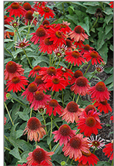
Sombrero Salsa Red Coneflower flowers

Sombrero Salsa Red Coneflower is recommended for the following landscape applications;