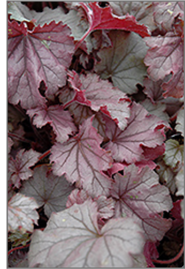
Little Cuties Sugar Berry Coral Bells foliage

Little Cuties Sugar Berry Coral Bells is recommended for the following landscape applications;