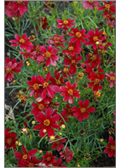
Red Satin Tickseed flowers