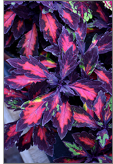
Marquee Special Effects Coleus foliage

Marquee Special Effects Coleus is recommended for the following landscape applications;