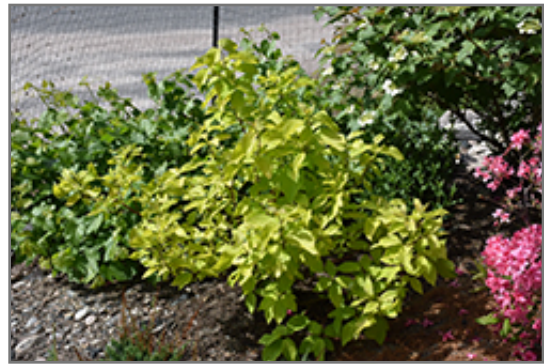
Neon Burst Dogwood