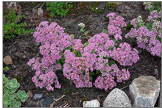
Lime Twister Stonecrop in bloom