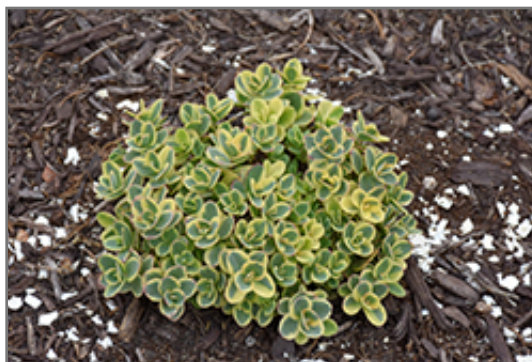
Lime Twister Stonecrop

Lime Twister Stonecrop is a fine choice for the garden, but it is also a good selection for planting in outdoor pots and containers. Because of its spreading habit of growth, it is ideally suited for use as a 'spiller' in the 'spiller-thriller-filler' container combination; plant it near the edges where it can spill gracefully over the pot. Note that when growing plants in outdoor containers and baskets, they may require more frequent waterings than they would in the yard or garden.