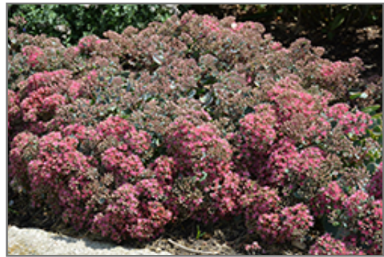
Popstar Stonecrop in bloom