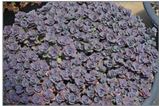
SunSparkler Blue Elf Sedoro