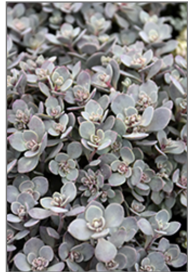
SunSparkler Blue Elf Sedoro foliage

SunSparkler Blue Elf Sedoro is a fine choice for the garden, but it is also a good selection for planting in outdoor pots and containers. Because of its spreading habit of growth, it is ideally suited for use as a 'spiller' in the 'spiller-thriller-filler' container combination; plant it near the edges where it can spill gracefully over the pot. Note that when growing plants in outdoor containers and baskets, they may require more frequent waterings than they would in the yard or garden.