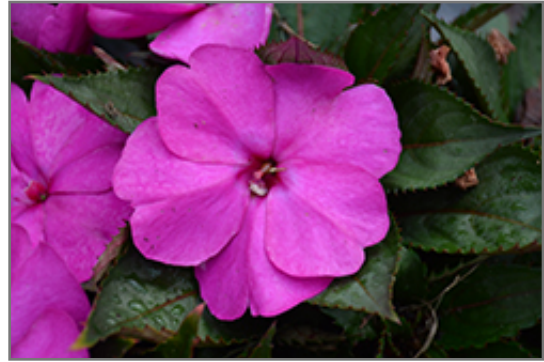
SunPatiens Compact Purple New Guinea Impatiens flowers

This plant will require occasional maintenance and upkeep, and should not require much pruning, except when necessary, such as to remove dieback. It has no significant negative characteristics.