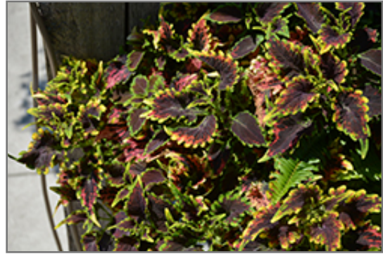
Sky Fire Coleus foliage

Sky Fire Coleus is recommended for the following landscape applications;