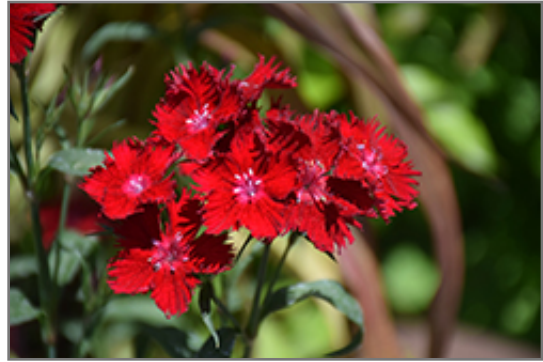
Rockin' Red Pinks flowers

This is a relatively low maintenance plant, and is best cleaned up in early spring before it resumes active growth for the season. It is a good choice for attracting bees and butterflies to your yard, but is not particularly attractive to deer who tend to leave it alone in favor of tastier treats. It has no significant negative characteristics.