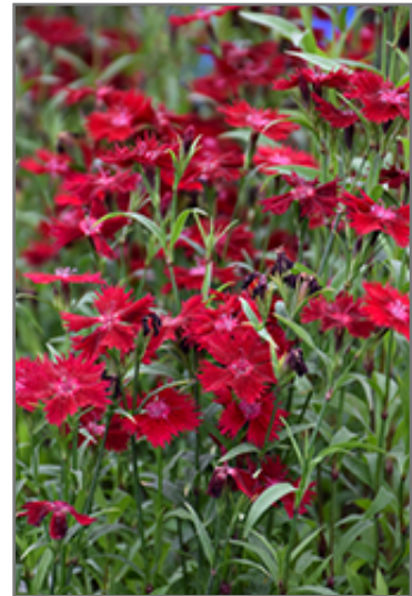
Rockin' Red Pinks flowers