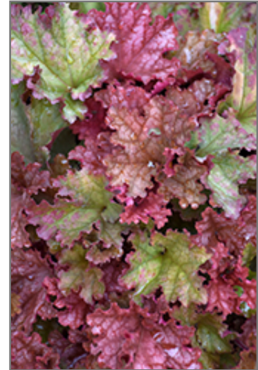
Peachberry Ice Coral Bells flowers

This is a relatively low maintenance plant, and should be cut back in late fall in preparation for winter. It is a good choice for attracting hummingbirds to your yard. It has no significant negative characteristics.