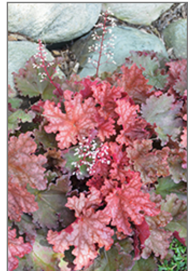
Peachberry Ice Coral Bells foliage