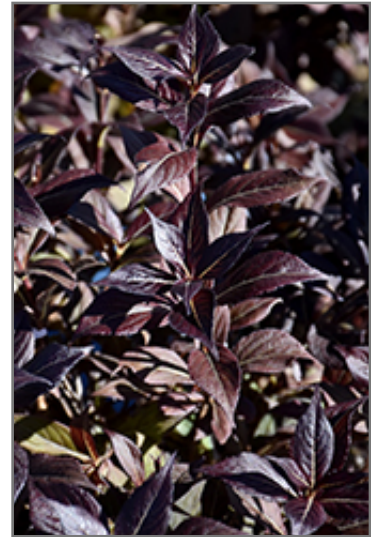
Date Night Stunner Weigela foliage