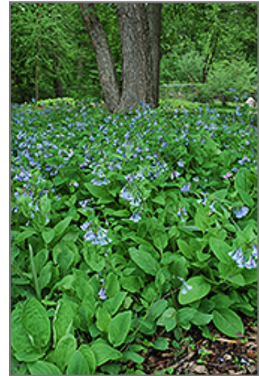
Virginia Bluebells in bloom