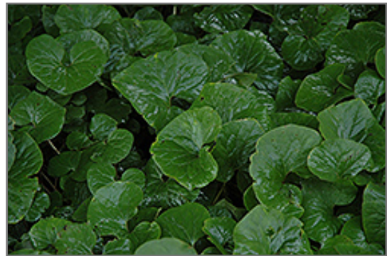
Canadian Wild Ginger