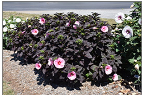
Summerific Edge of Night Hibiscus in bloom