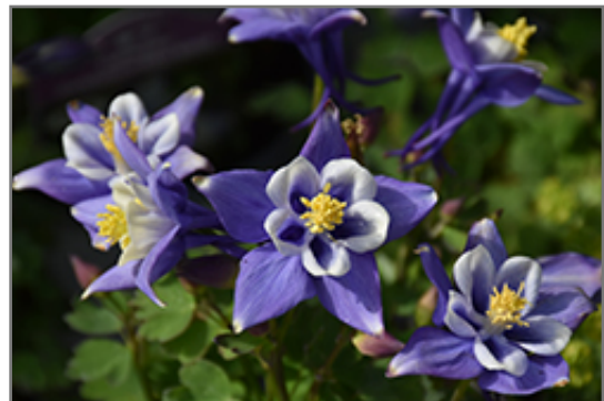
Earlybird Blue and White Columbine flowers