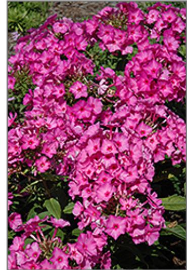
Flame Pink Garden Phlox flowers