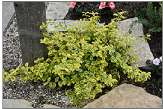
Gold Splash Wintercreeper