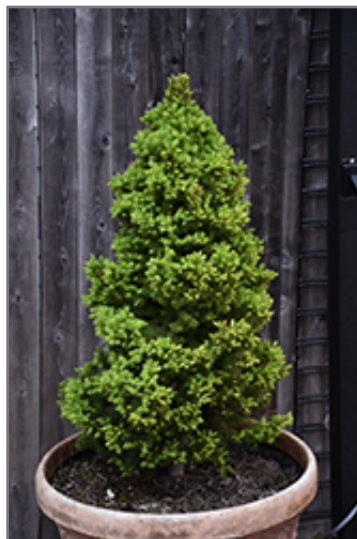
Rainbow's End Spruce