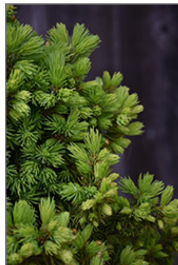
Rainbow's End Spruce foliage

This shrub should only be grown in full sunlight. It prefers to grow in average to moist conditions, and shouldn't be allowed to dry out. It is not particular as to soil type or pH. It is somewhat tolerant of urban pollution, and will benefit from being planted in a relatively sheltered location. This is a selection of a native North American species.