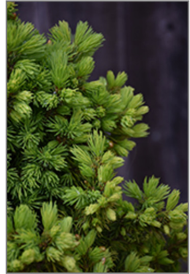
Rainbow's End Spruce foliage

This shrub should only be grown in full sunlight. It prefers to grow in average to moist conditions, and shouldn't be allowed to dry out. It is not particular as to soil type or pH. It is somewhat tolerant of urban pollution, and will benefit from being planted in a relatively sheltered location. This is a selection of a native North American species.