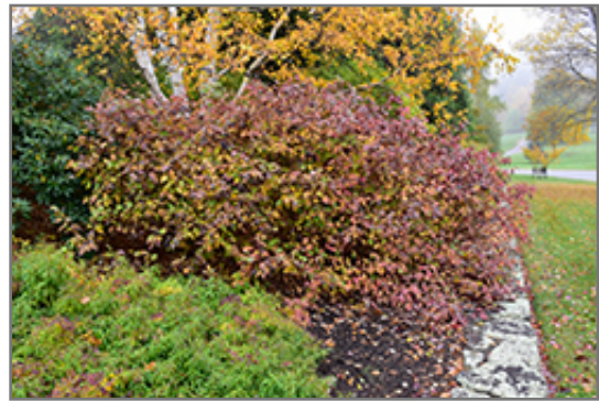
Bailey Red-Twig Dogwood in fall