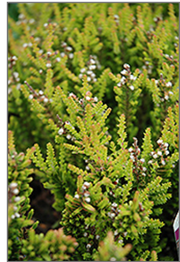
Firefly Heather foliage