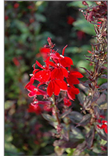
Queen Victoria Lobelia flowers