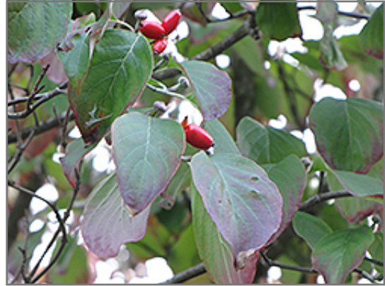
Cherokee Chief Flowering Dogwood fruit

This tree does best in full sun to partial shade. You may want to keep it away from hot, dry locations that receive direct afternoon sun or which get reflected sunlight, such as against the south side of a white wall. It requires an evenly moist well-drained soil for optimal growth, but will die in standing water. It is very fussy about its soil conditions and must have rich, acidic soils to ensure success, and is subject to chlorosis (yellowing) of the foliage in alkaline soils. It is quite intolerant of urban pollution, therefore inner city or urban streetside plantings are best avoided, and will benefit from being planted in a relatively sheltered location. Consider applying a thick mulch around the root zone in winter to protect it in exposed locations or colder microclimates. This is a selection of a native North American species.