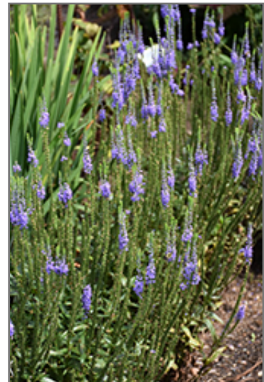
Blue Skywalker Speedwell flowers