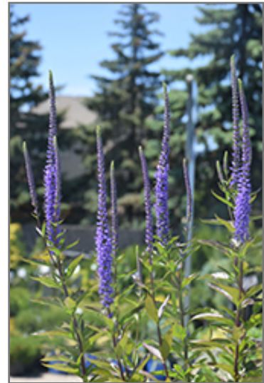
Blue Skywalker Speedwell flowers