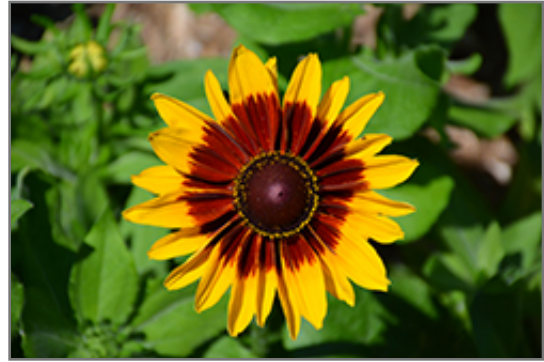
Denver Daisy Coneflower flowers

Denver Daisy Coneflower is an herbaceous perennial with an upright spreading habit of growth. Its medium texture blends into the garden, but can always be balanced by a couple of finer or coarser plants for an effective composition.