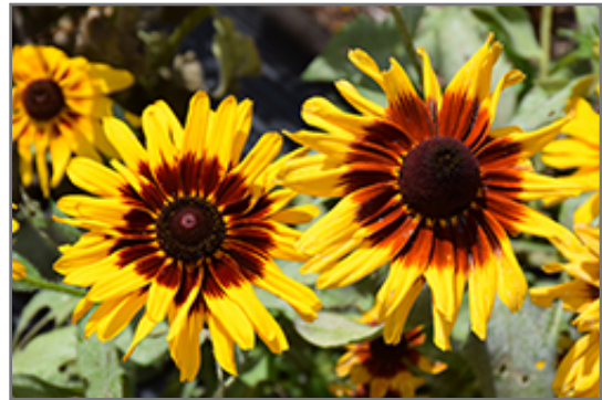
Denver Daisy Coneflower flowers