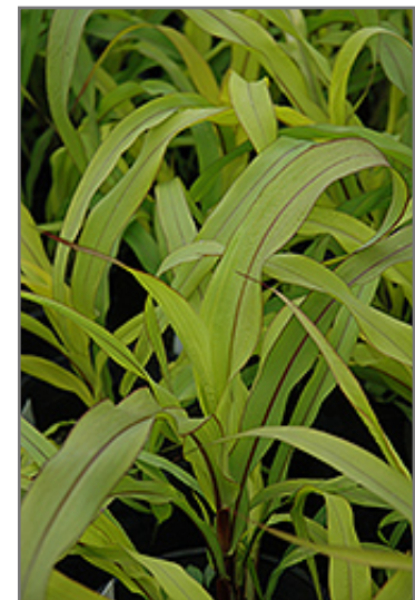
Jester Millet foliage