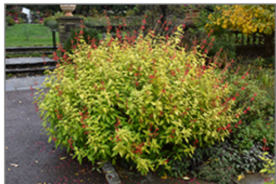
Golden Delicious Pineapple Sage in bloom