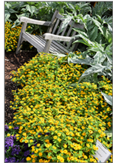
Showstar Melampodium in bloom