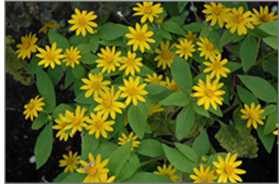
Showstar Melampodium flowers

Showstar Melampodium is recommended for the following landscape applications;