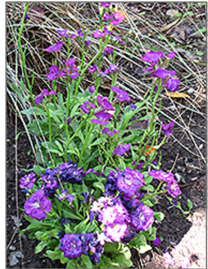
Purple Stock in bloom