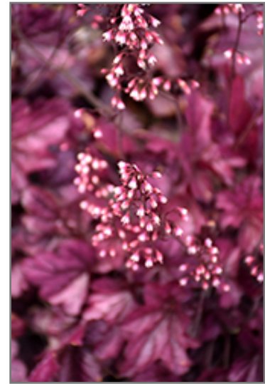
Wild Rose Coral Bells flowers