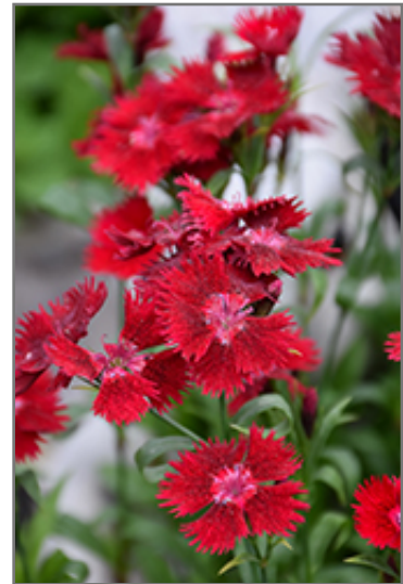
Rockin' Red Pinks flowers