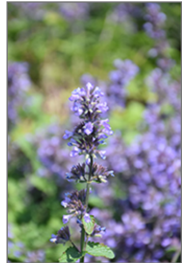
Cat's Pajamas Catmint flowers

Cat's Pajamas Catmint is recommended for the following landscape applications;