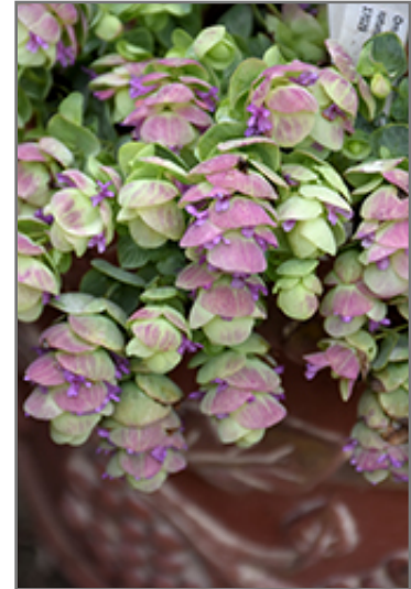
Kirigami Oregano flowers

Kirigami Oregano is recommended for the following landscape applications;