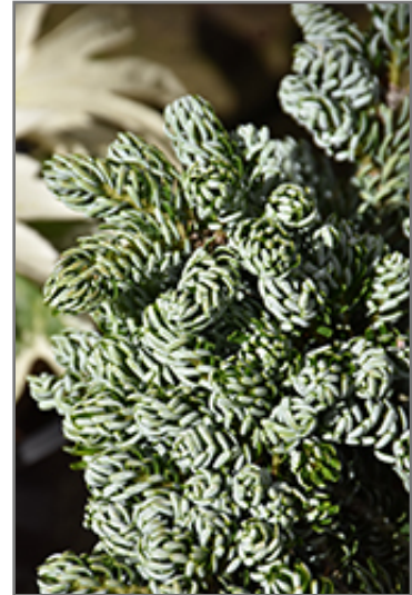
Kohout's Icebreaker Korean Fir foliage

Kohout's Icebreaker Korean Fir will grow to be about 3 feet tall at maturity, with a spread of 4 feet. It tends to fill out right to the ground and therefore doesn't necessarily require facer plants in front. It grows at a slow rate, and under ideal conditions can be expected to live for 60 years or more.