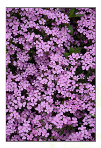
Rock Soap<mark>w</mark>ort flowers