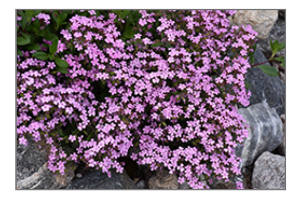
Rock Soapwort in bloom