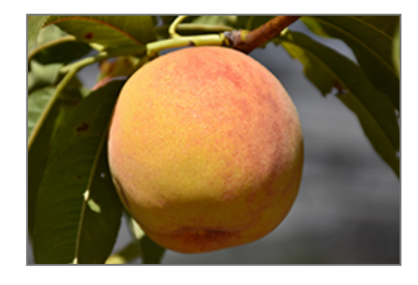
Reliance Peach fruit