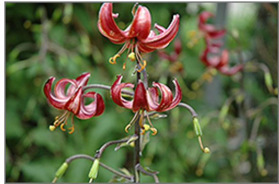
Claude Shride Martagon Lily flowers