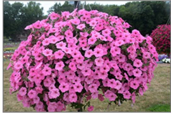
Supertunia Vista Bubblegum Petunia in bloom

Supertunia Vista Bubblegum Petunia is a fine choice for the garden, but it is also a good selection for planting in outdoor containers and hanging baskets. Because of its trailing habit of growth, it is ideally suited for use as a 'spiller' in the 'spiller-thriller-filler' container combination; plant it near the edges where it can spill gracefully over the pot. Note that when growing plants in outdoor containers and baskets, they may require more frequent waterings than they would in the yard or garden.