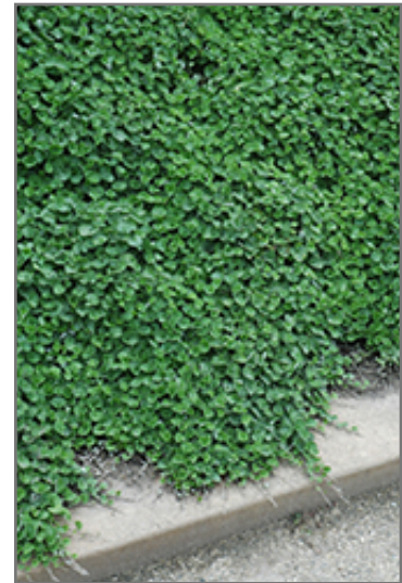
Emerald Falls Dichondra