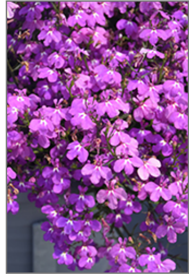
Techno Violet Lobelia flowers

Techno Violet Lobelia is recommended for the following landscape applications;