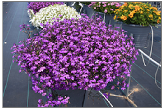
Techno Violet Lobelia in bloom