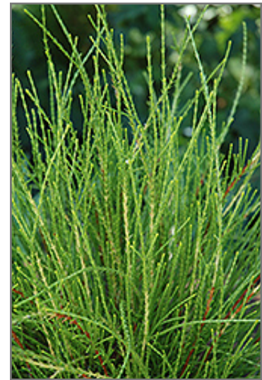
Franky Boy Arborvitae foliage