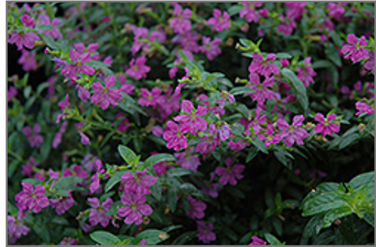
Allyson Mexican Heather flowers