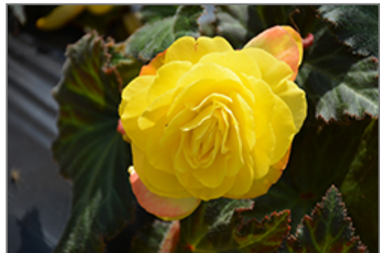
Nonstop Mocca Yellow Begonia flowers